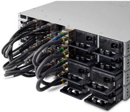
Figure 7. Cisco Catalyst 9300 Series StackPower