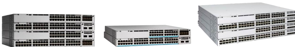
Figure 1. Cisco Catalyst 9300 Series switches

The Cisco Catalyst 9300 Series is made up of nineteen modular uplink switch models and fourteen fixed uplink switch models.