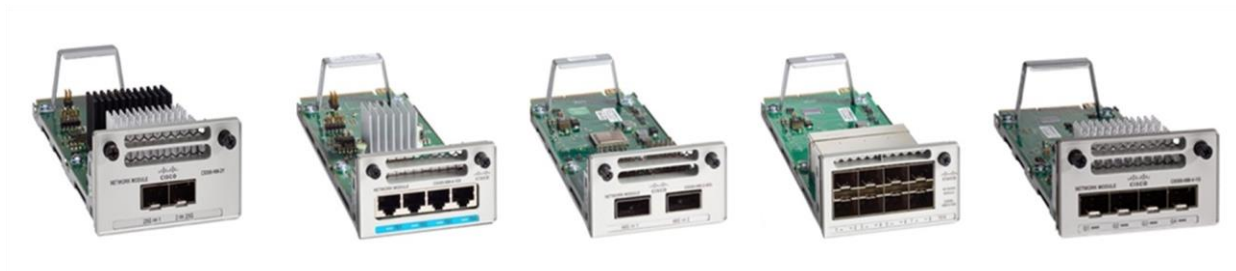
Figure 3. Cisco Catalyst 9300 Series Network Modules